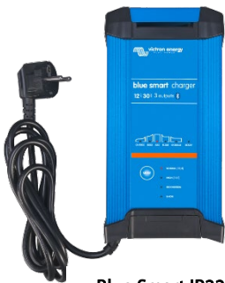
Blue Smart IP22 12/30 (3)