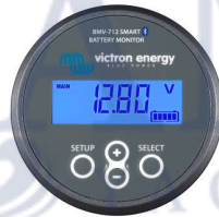
BMV-712 Smart Battery Monitor