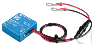
Smart Battery Sense Enables temperature and voltage compensated charging.